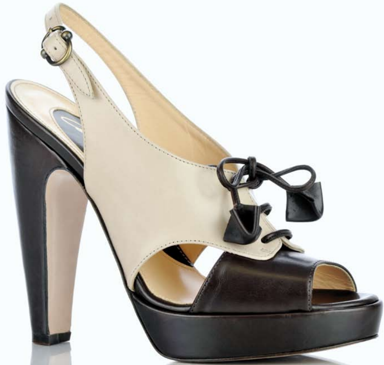
HIGH HEEL PLATFORM LACE-UP SLINGBACK SANDAL, IVORY AND DARK BROWN BABY CALF