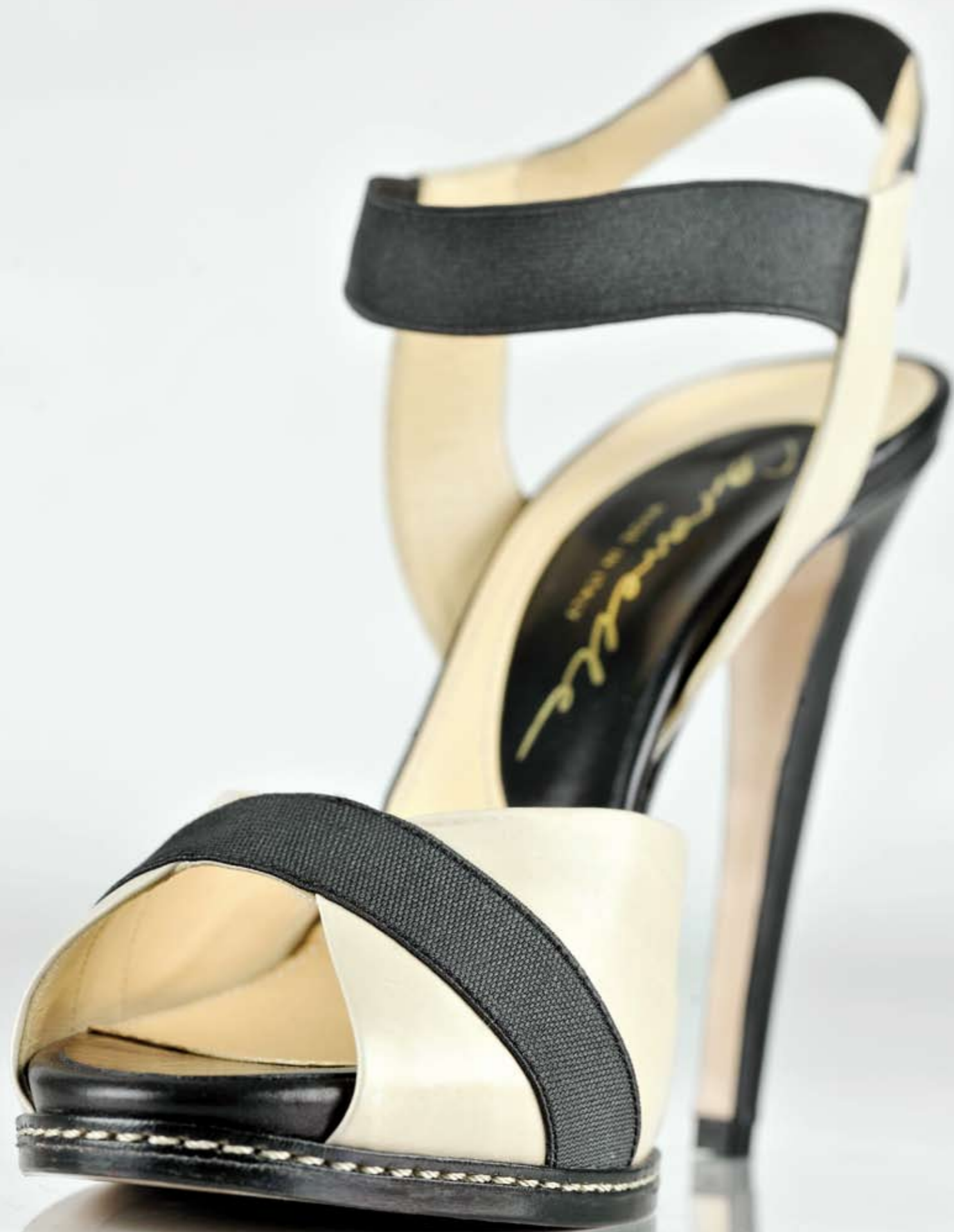
HIGH HEEL PLATFORM SANDAL WITH ANKLE STRAP, IVORY BABY CALF AND BLACK ELASTIC