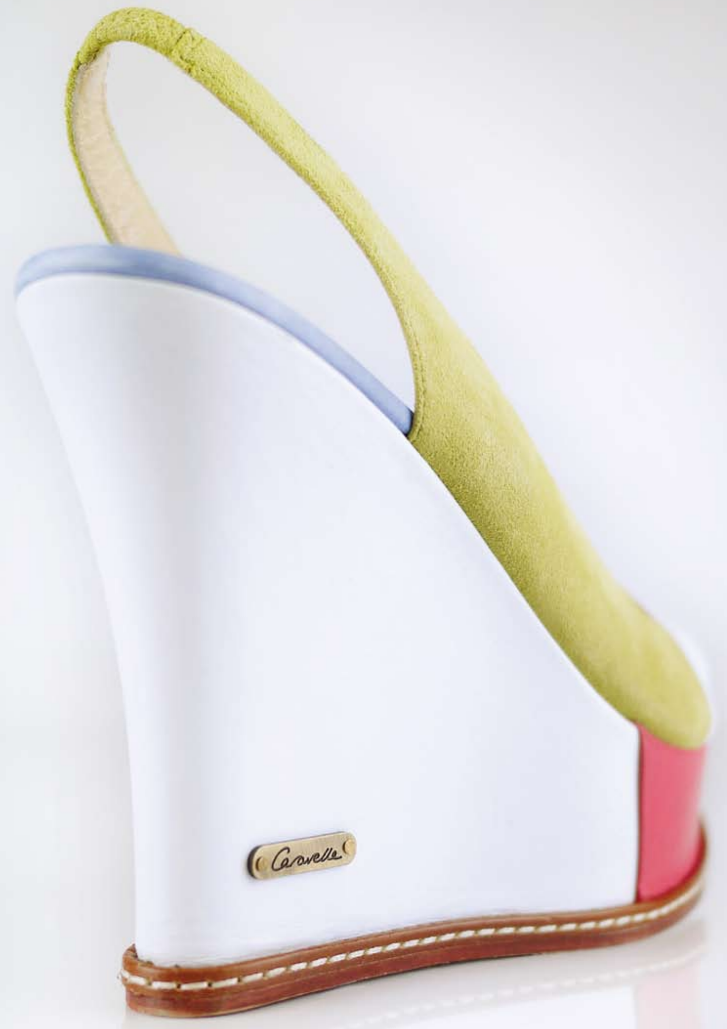
HIGH HEEL SLINGBACK WEDGE SANDAL, LIGHT GREEN SUEDE, WHITE, FUSCHIA AND LILAC NAPPA