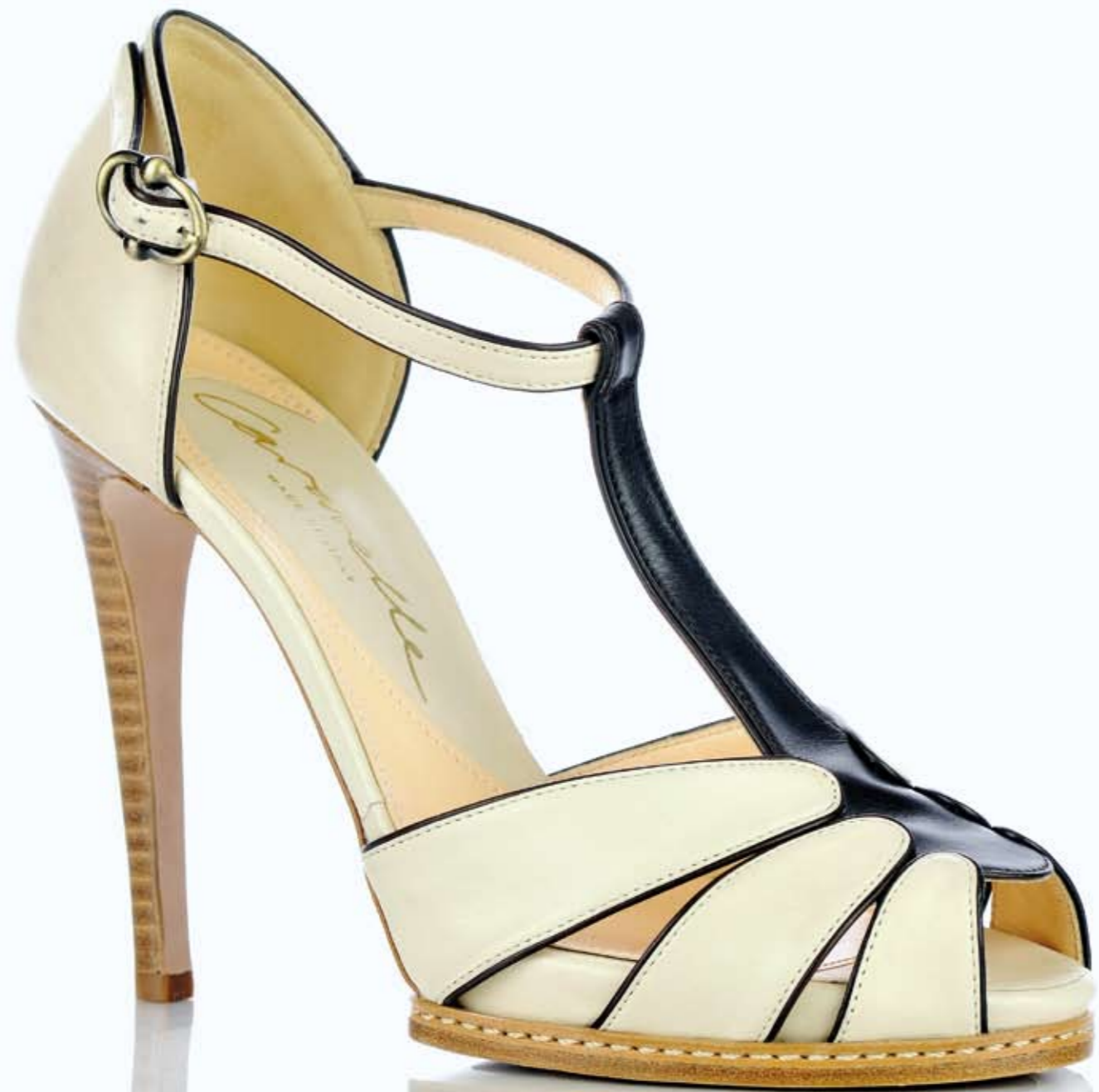
HIGH HEELT-STRAP PLATFORM SANDAL, IVORY AND DARK BROWN BABY CALF