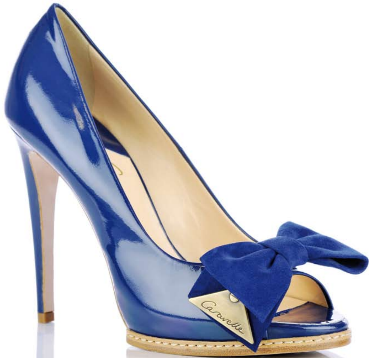
HIGH HEEL OPEN-TOE PLATFORM PUMP WITH TIED LEATHER RIBBON AND BRASS DETAIL, BLUE PATENT LEATHER AND SUEDE