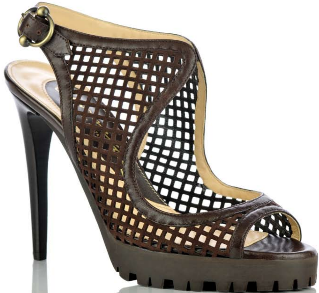
HIGH HEEL RUBBER SOLE PERFORATED-UPPER SANDAL, DARK BROWN SUEDE AND NAPPA