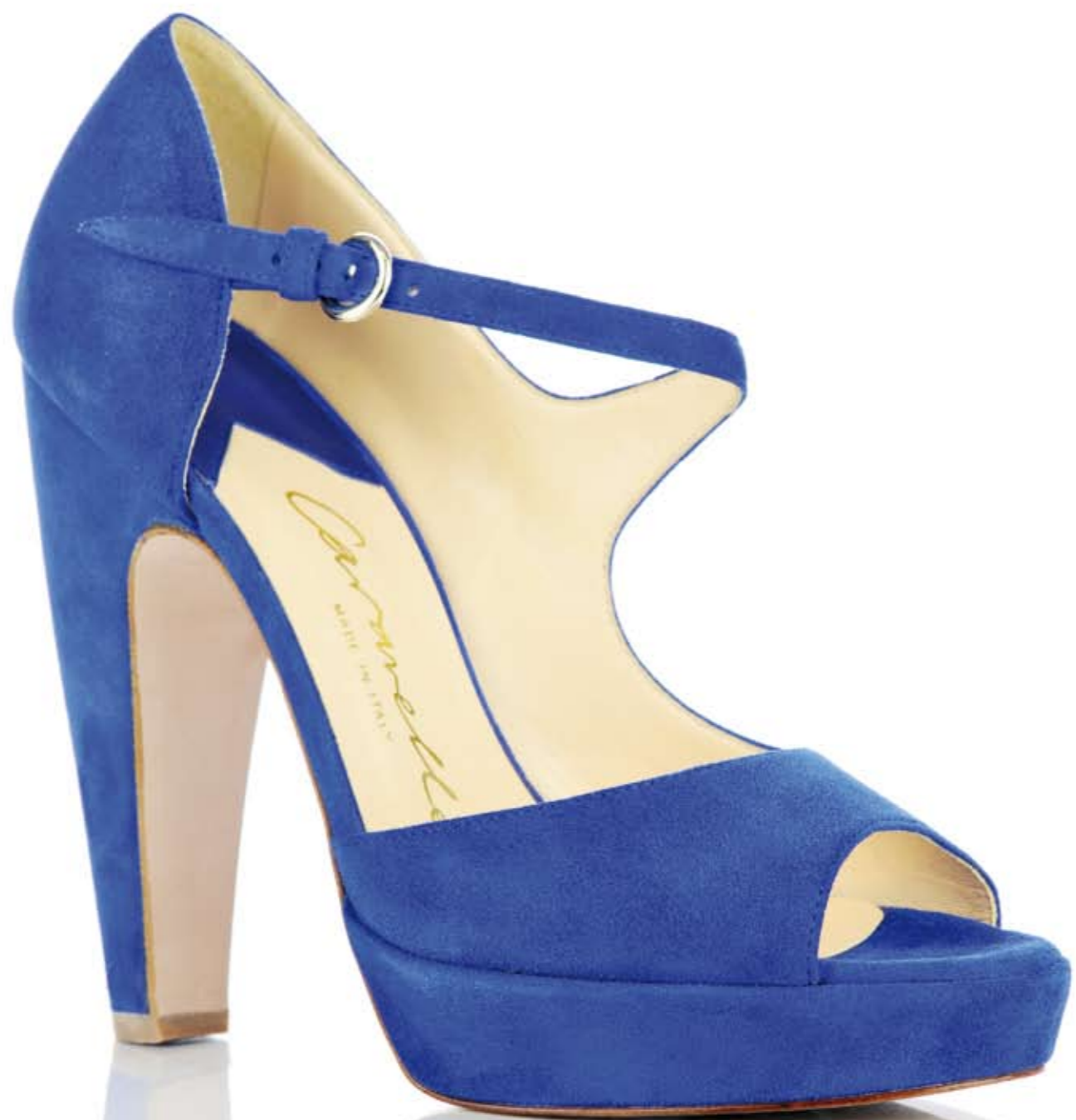
HIGH HEEL PLATFORM SANDAL WITH SILVER BUCKLE, BLUE SUEDE