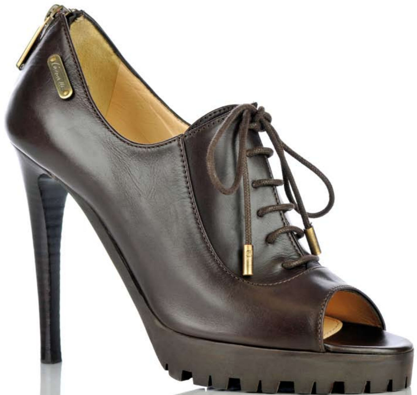
HIGH HEEL RUBBER SOLE OPEN-TOE BOOTIE, DARK BROWN CALF