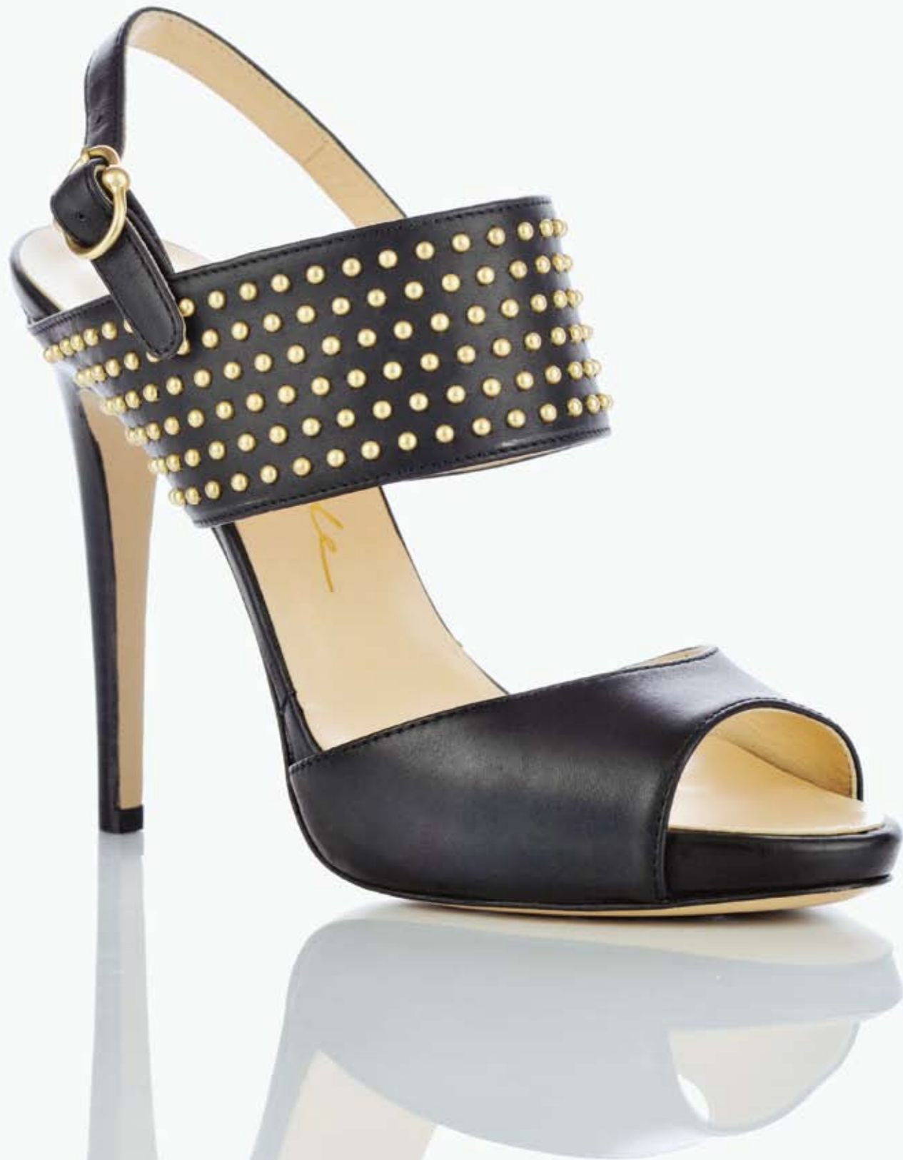
HIGH HEEL PLATFORM SANDAL WITH METAL STUDS, BLACK CALF