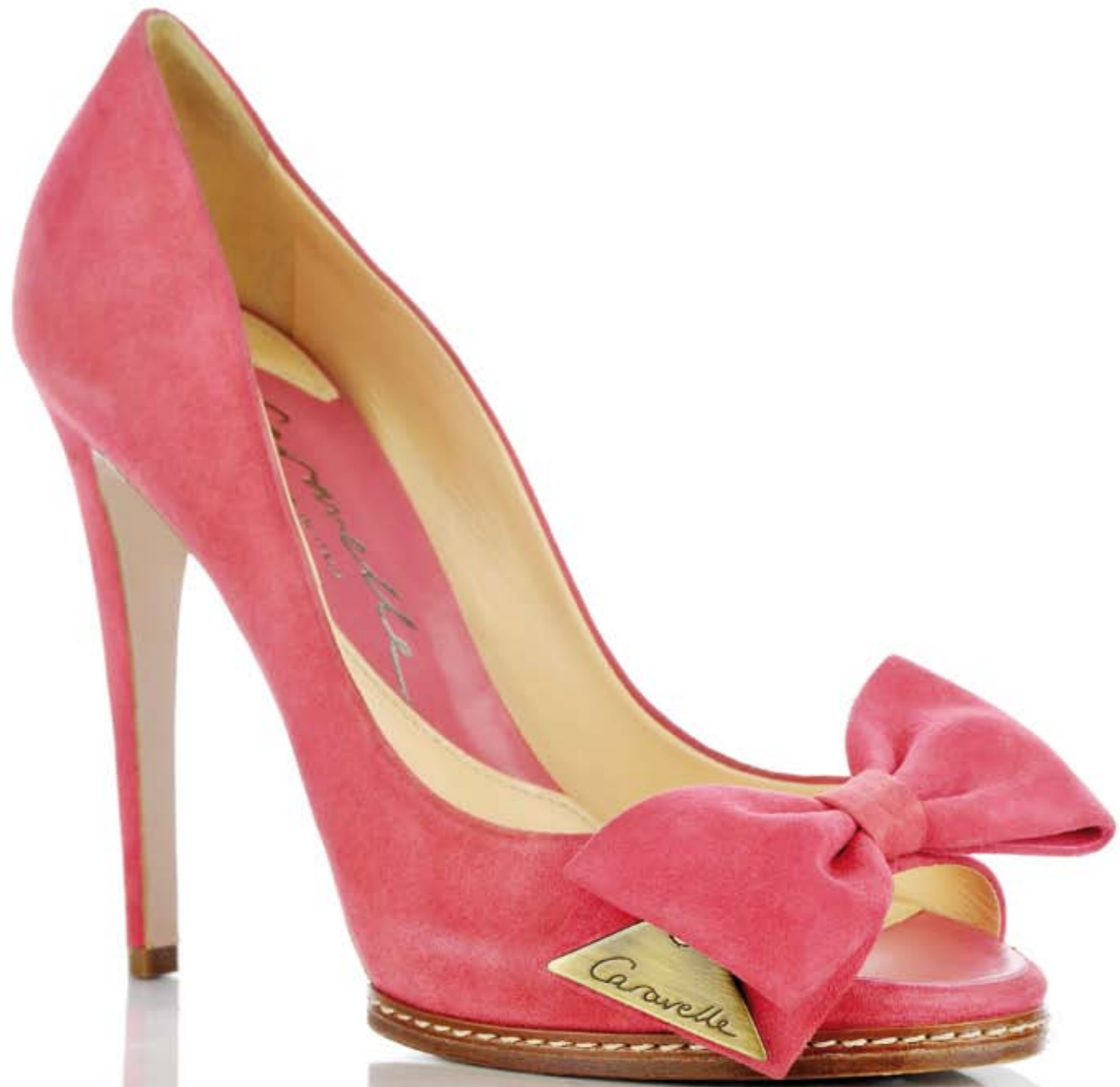
HIGH HEEL OPEN-TOE PLATFORM PUMP WITH TIED LEATHER RIBBON AND BRASS DETAIL, FUCHSIA SUEDE